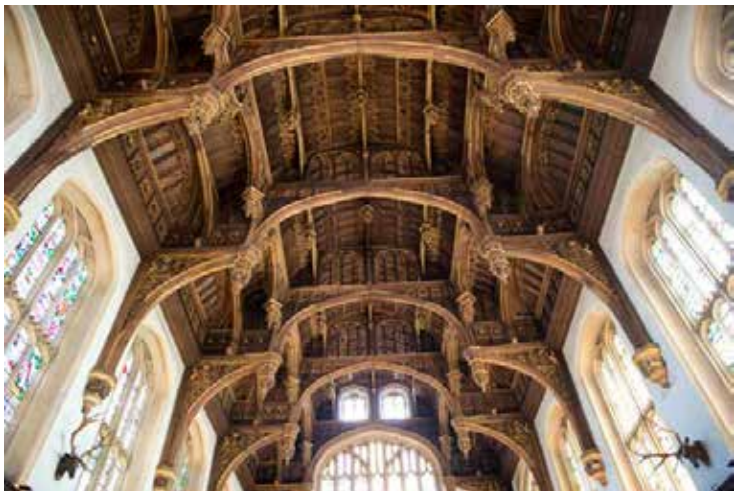
Entrance to New West End Synagogue in St.Petersburgh Place London