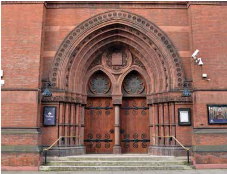
Entrance to New West End Synagogue in St. Petersburg Place London