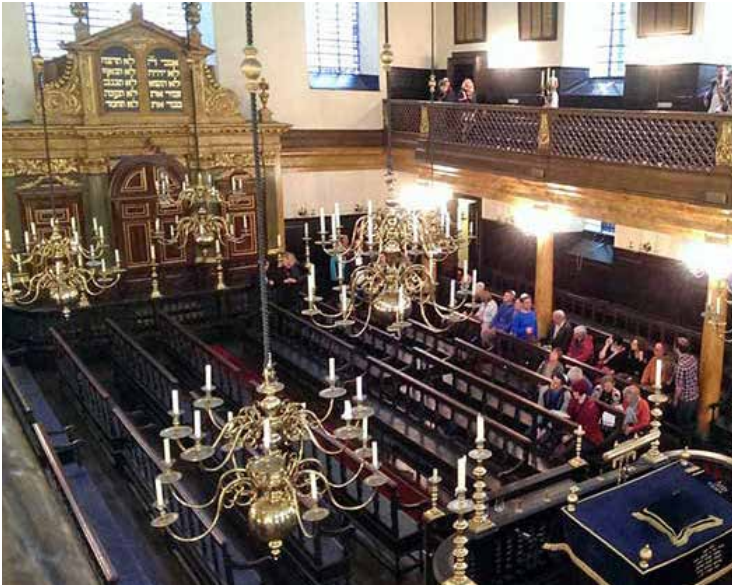
Bevis Marks Synagogue interior, London