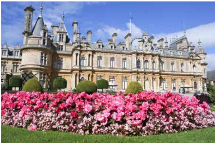
Waddeson Manor was built for Baron Ferdinand de Rothschild in the 1870s.