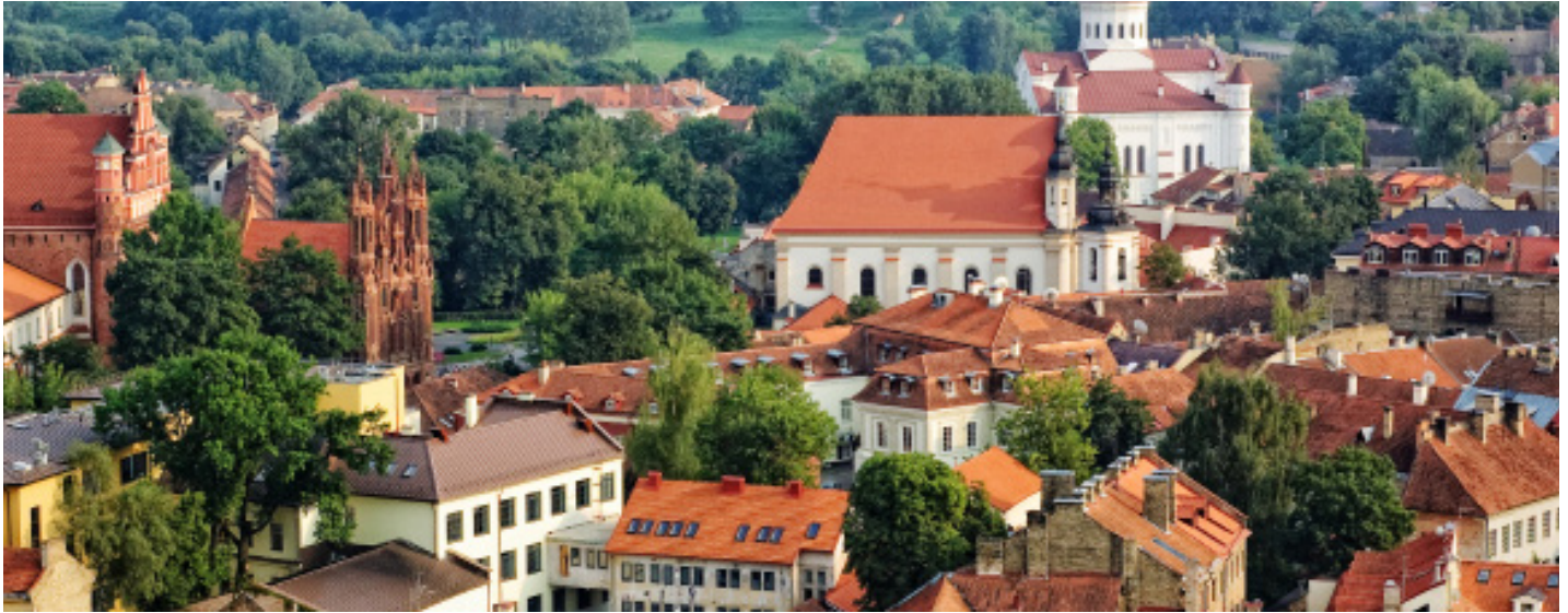
Old Town Vilnius, Lithuania