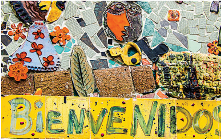
Tile art project, Havana