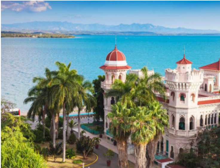
Palacio de Valle, Cienfuegos