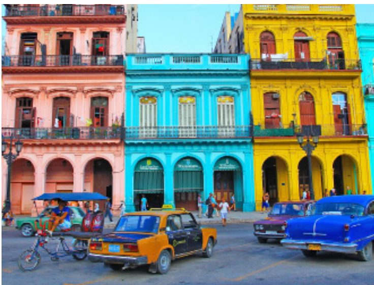
Havana is known for its colorful buildings and antique autos.