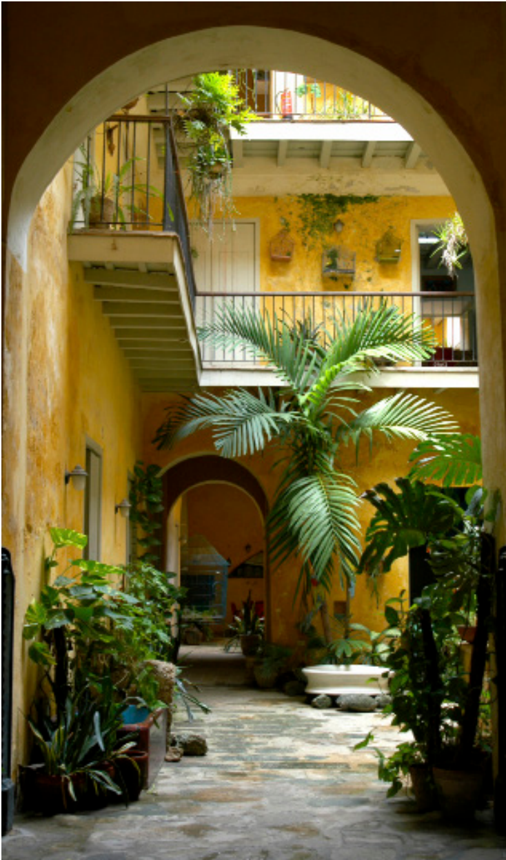
Typical interior courtyard, Havana

We invite you to join us on this extraordinary program, limited to 30 participants. (Please note: we expect this trip to fill quickly; last year, we had to turn away many interested people. Please register early to ensure your participation.)