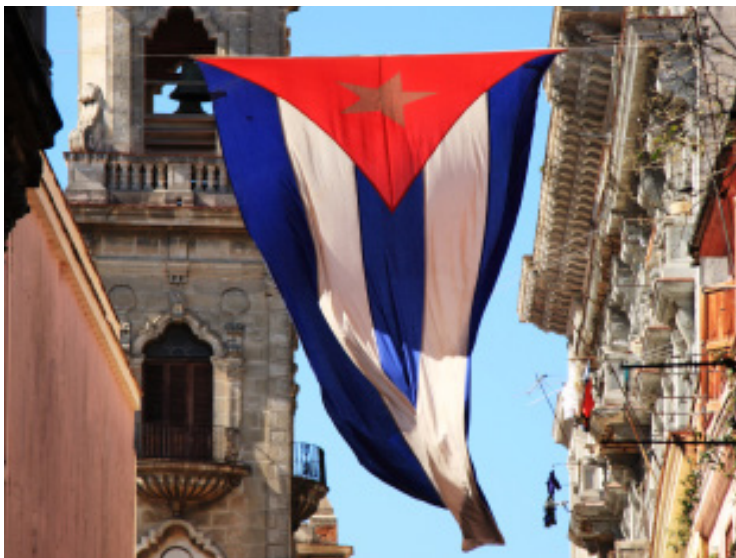
Cuban flag flies in Havana breeze.