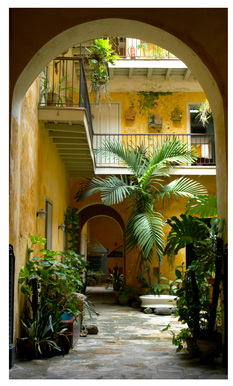
Typical interior courtyard, Havana