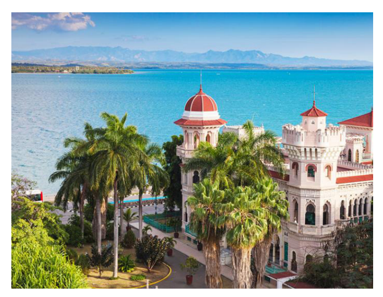
Palacio de Valle, Cienfuegos