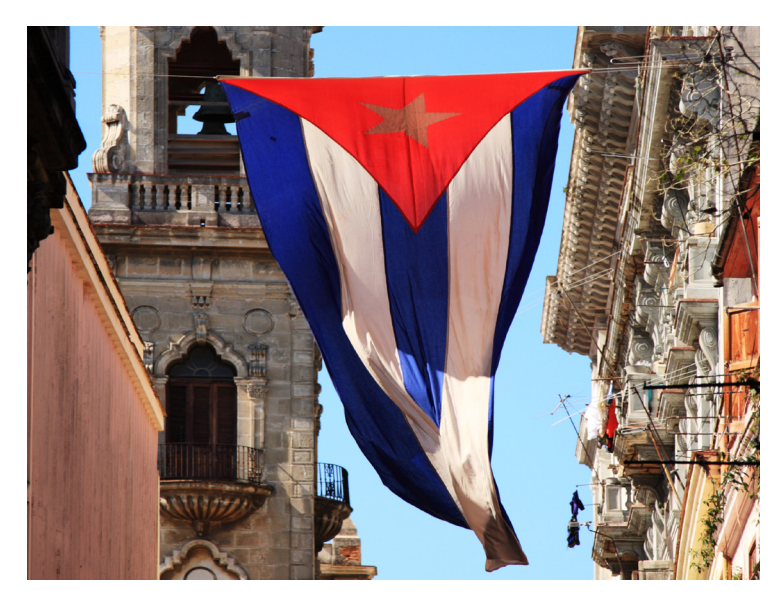
Cuban flag flies in Havana breeze.