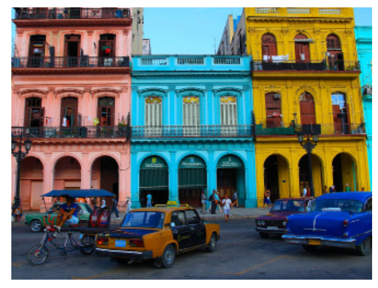
Havana is known for its colorful buildings and antique autos.