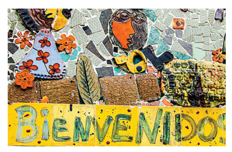
Tile art project, Havana