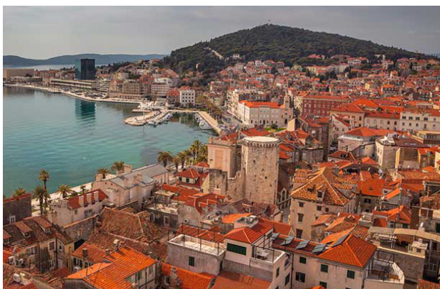
photos: Teatro Romano, Trieste (ruins of a Roman theater); Miramare Castle, the 19th century home of Austrian Archduke Maximilian; ariel view of Zagreb, Croatia.