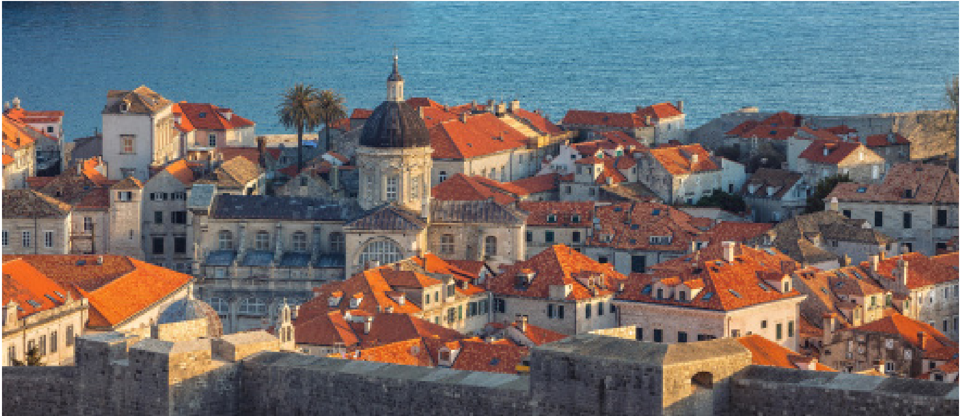
Roof tops of Zagreb, Croatia