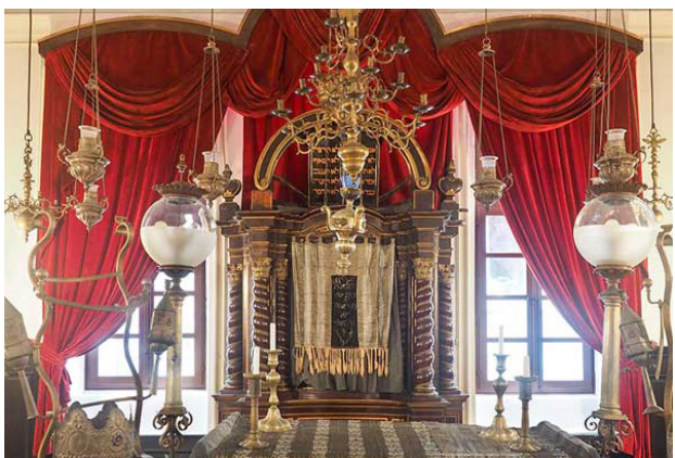
photos: Zagreb marketplace; Plitvice Lakes National Park; interior of the synagogue in the walled city in Dubrovnik, Croatia.