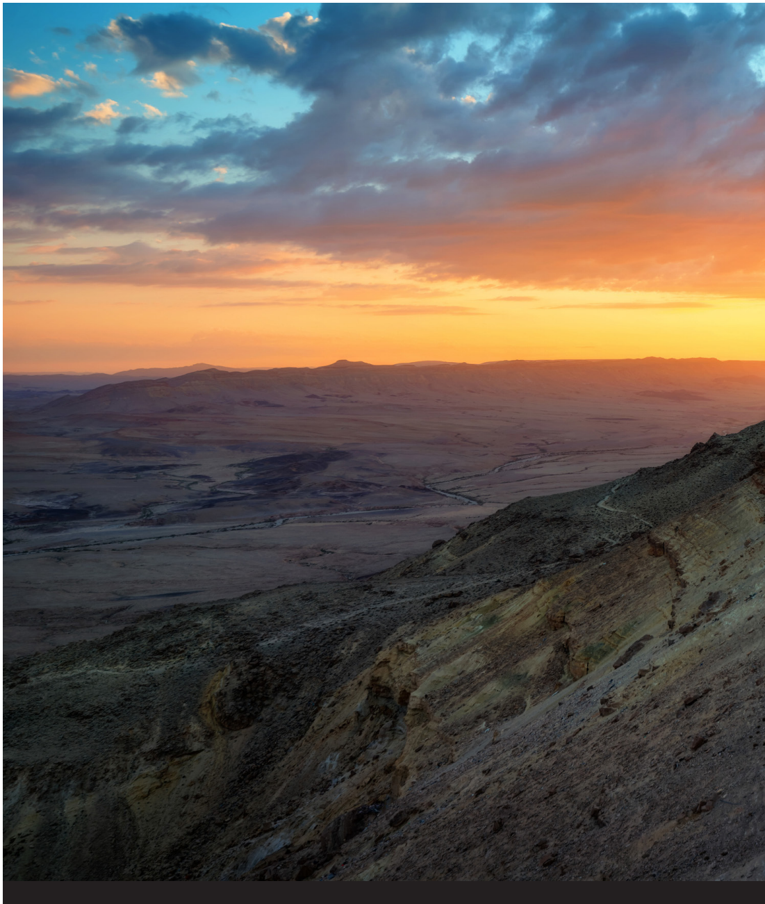
Mitzpe Ramon, Israel