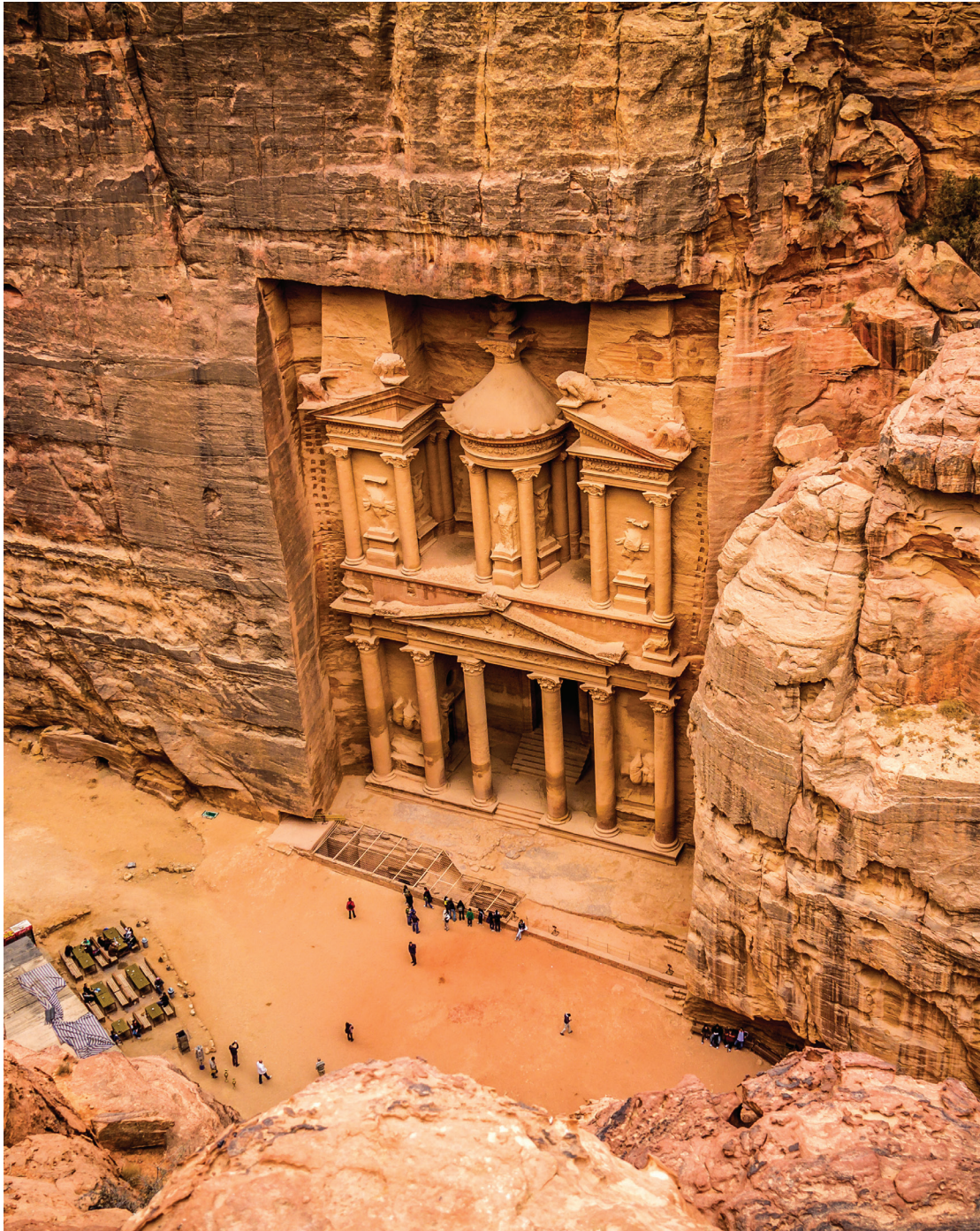
The Treasury, Petra, Jordan