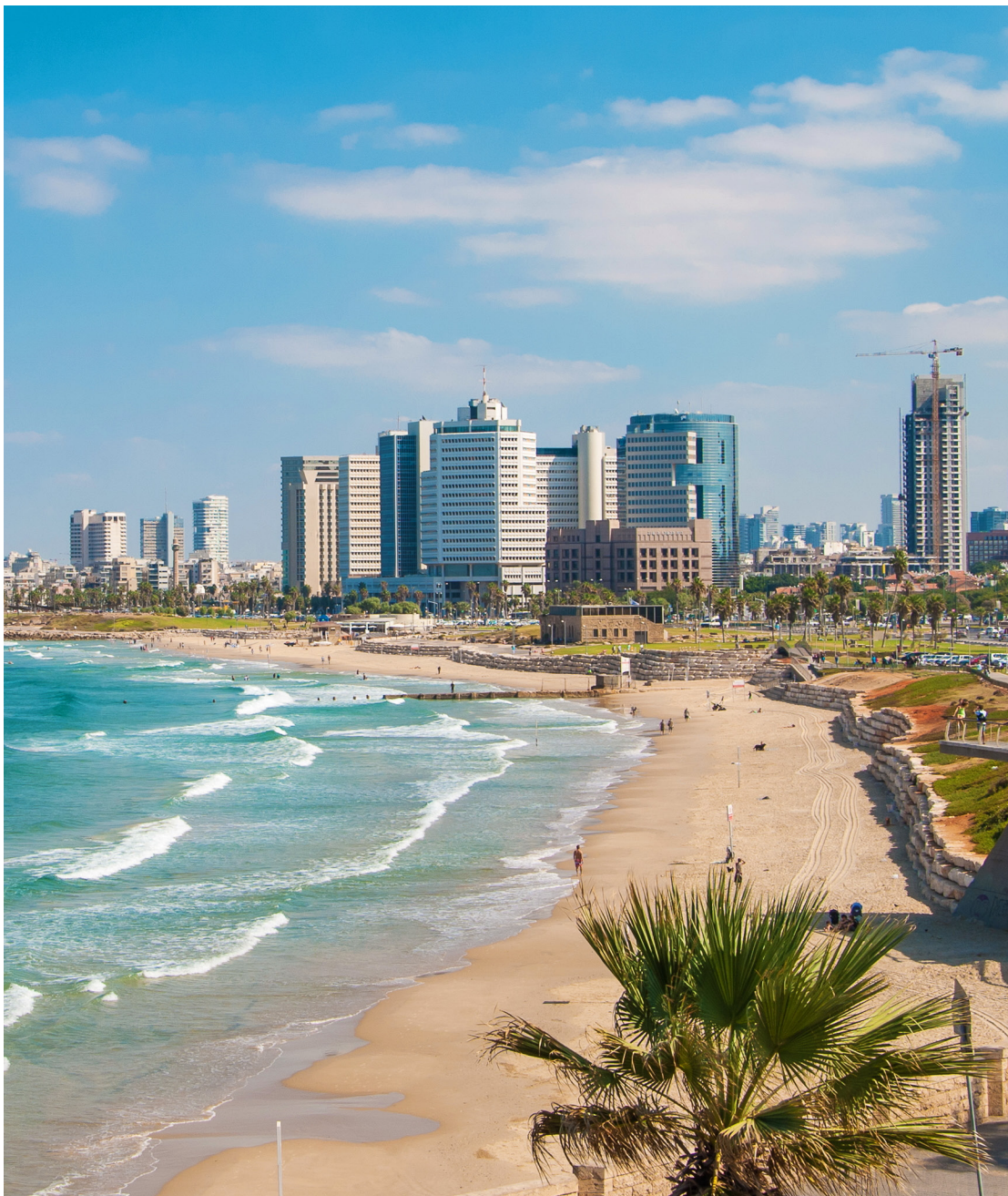
Tel Aviv, Israel