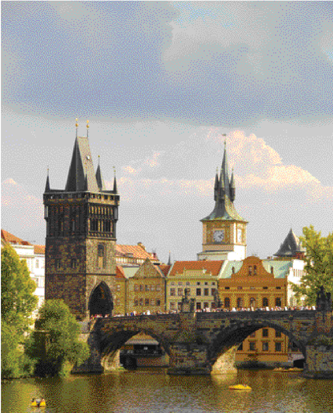
Charles Bridge, Prague