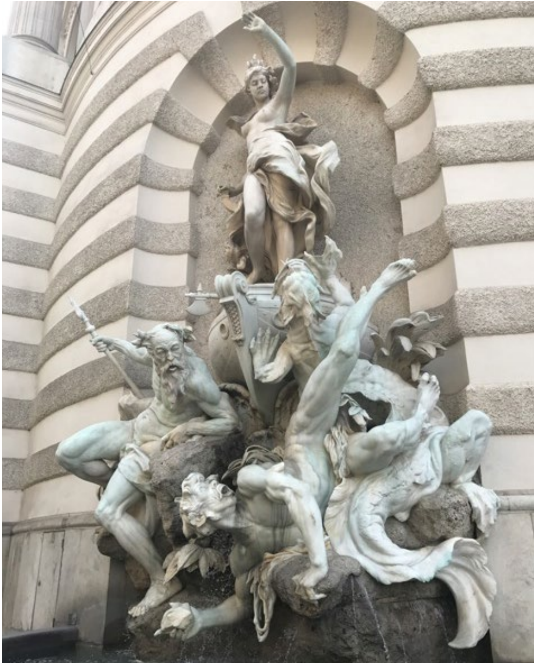
Hofburg Palace, Michaelplatz, Vienna