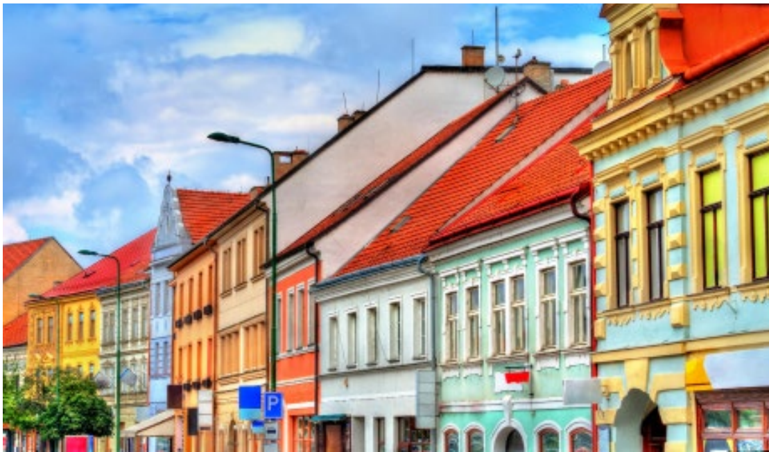
Třebíč Old Town