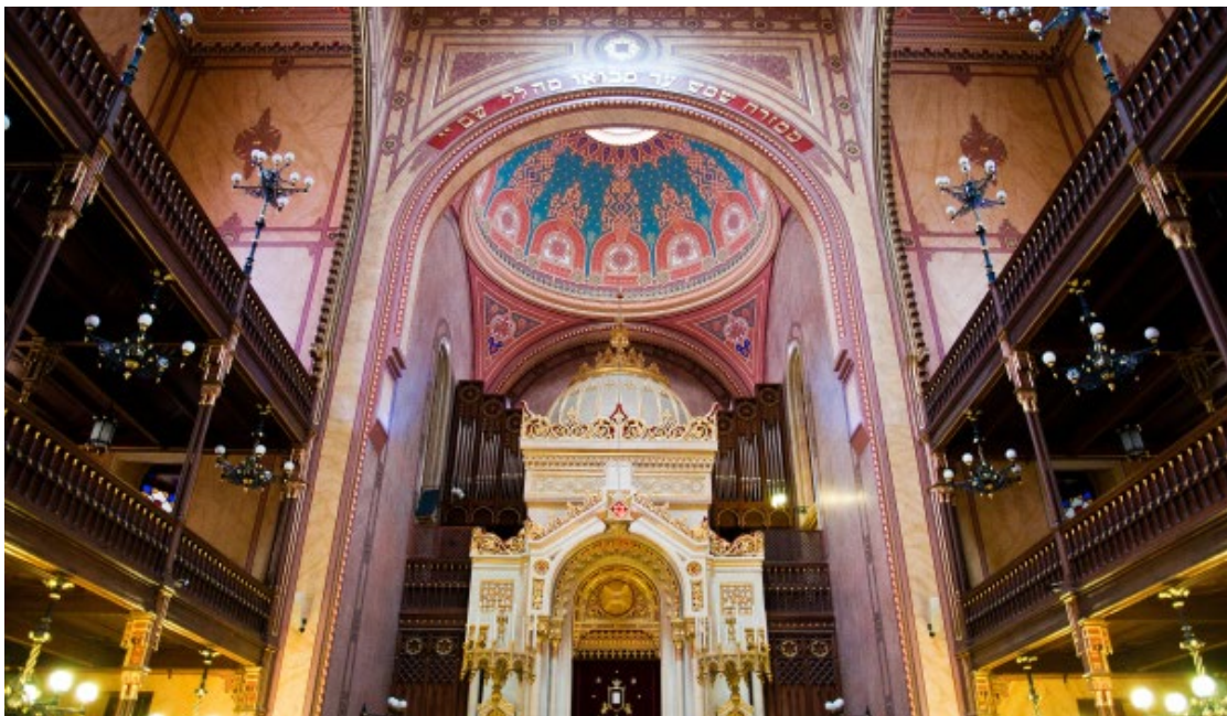
Great Synagogue, Budapest