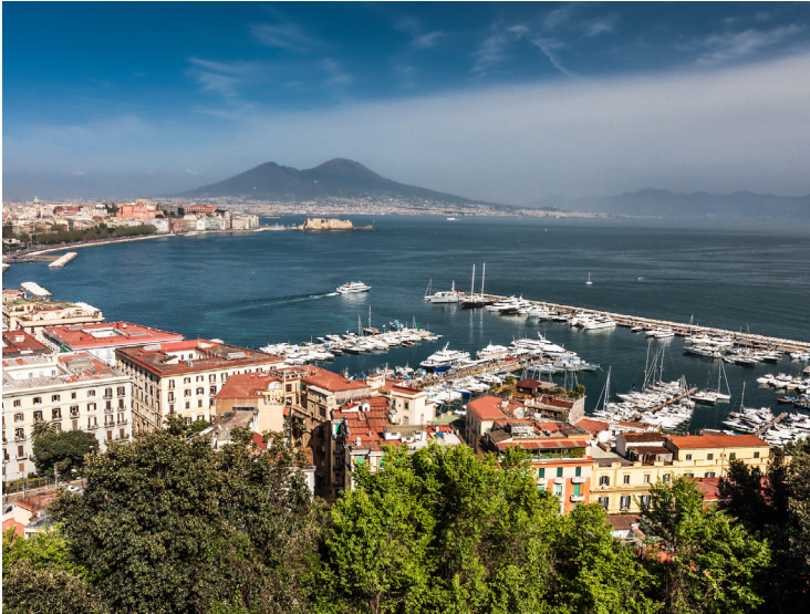
Naples with Mount Vesuvius in the background.

Break for lunch (included) before a guided visit to Herculaneum, a UNESCO World Heritage site – a wealthier town than Pompeii, possessing an extraordinary density of fine houses with far more