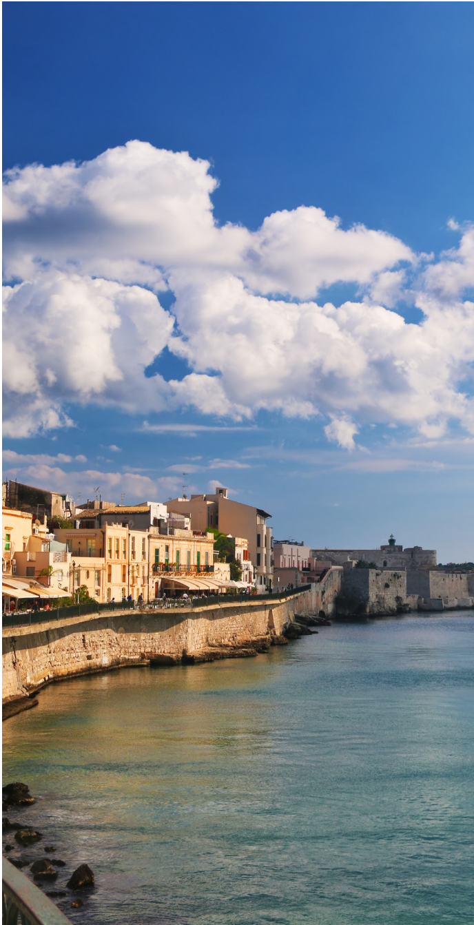
Promenade, Siracusa, Sicily