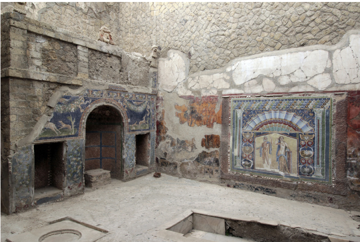
Ruins of Herculaneum