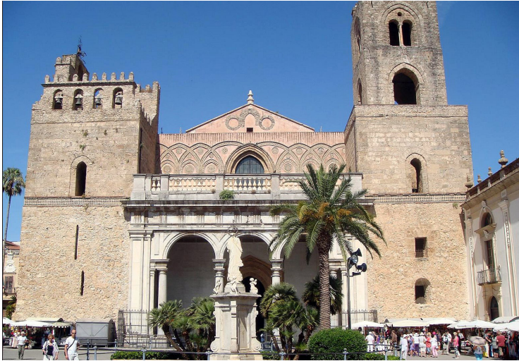
Monreale Cathedral, Palermo