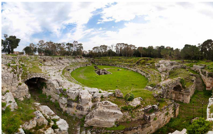
Archaeological park of the Neapolis, Siracusa