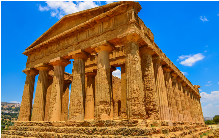
Ruins of ancient temple in Agrigento

lavish use of colored marble cladding. A large number of artifacts from Herculaneum are preserved in the Naples National Archaeological Museum. Departure for the airport and an evening flight to Palermo. Check in to the Villa Igiea, a five-star deluxe hotel in Palermo.