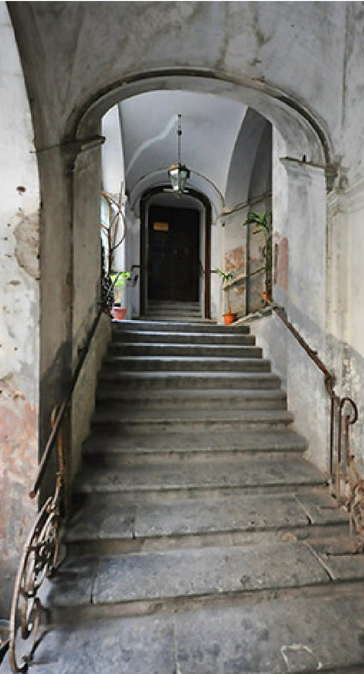
Synagogue stairway, Naples