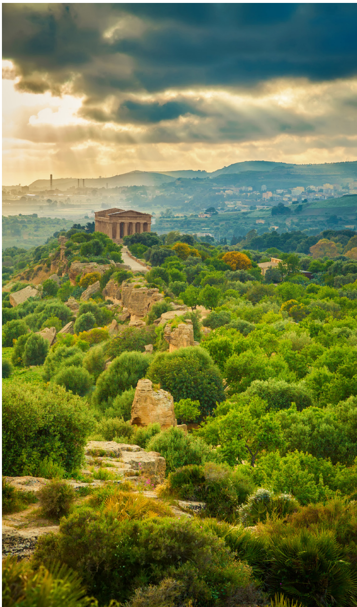
Valley of Temples near Agrigento