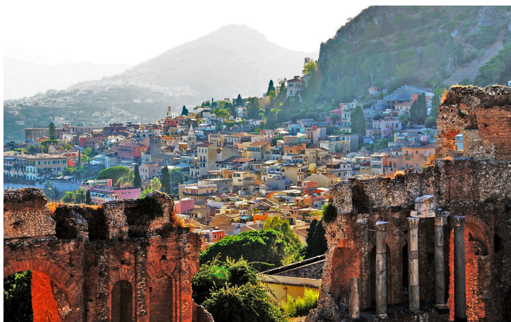
View of Taormina from the ancient amphitheater