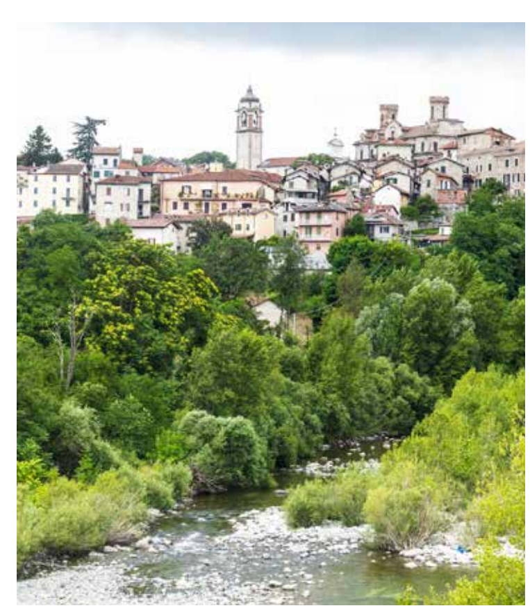
Molare (Alessandria, Piedmont, Italy): the historic town in Monferrato and the Orba creek