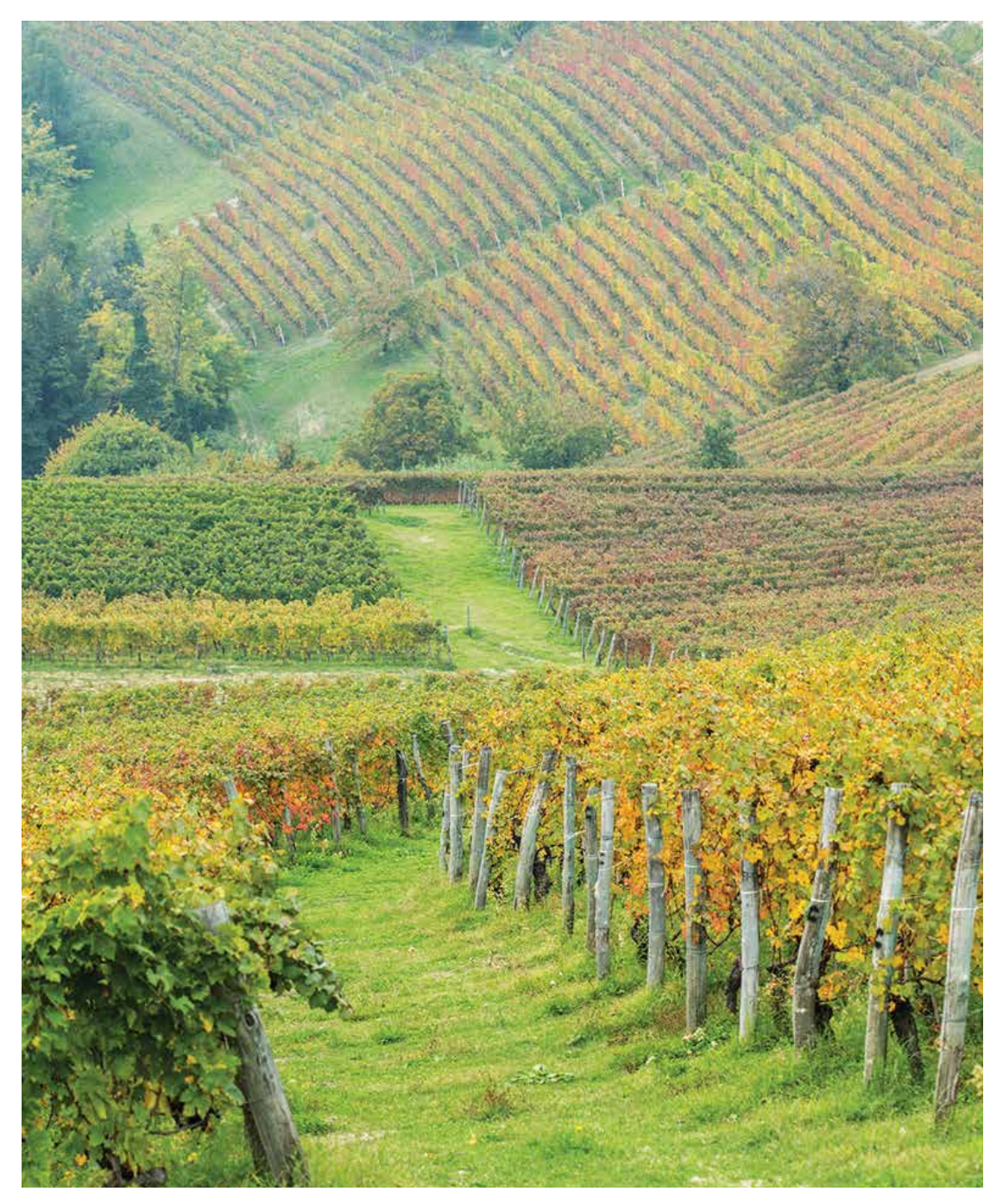
Pathway through vineyards, Piedmont, Italy