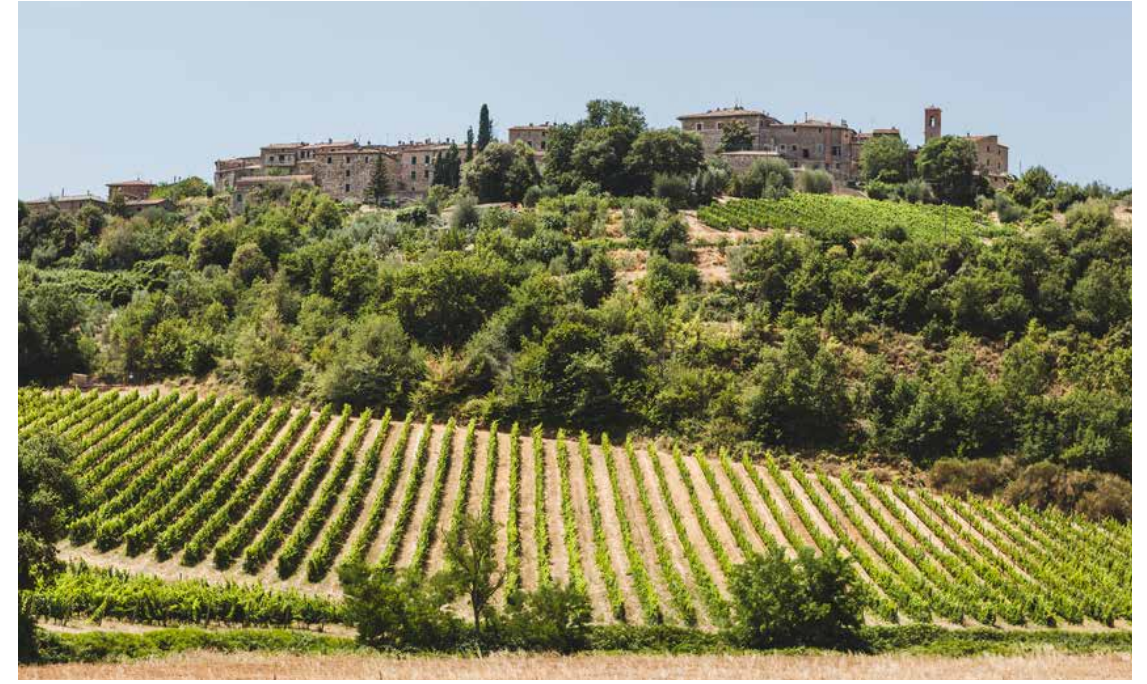
Photos: top, view of Bologna; below, Hilltop village with vineyards below., Piedmont