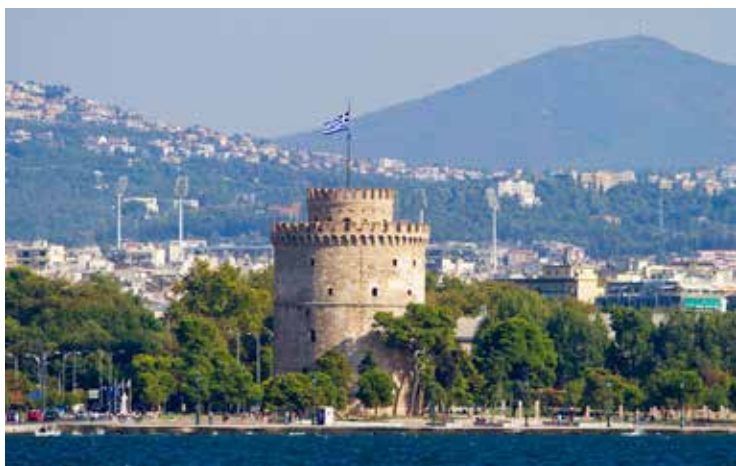
White Tower, Thessaloniki, Greece

*Please Note: Daily schedule may be modified subject to weather or unanticipated changes.