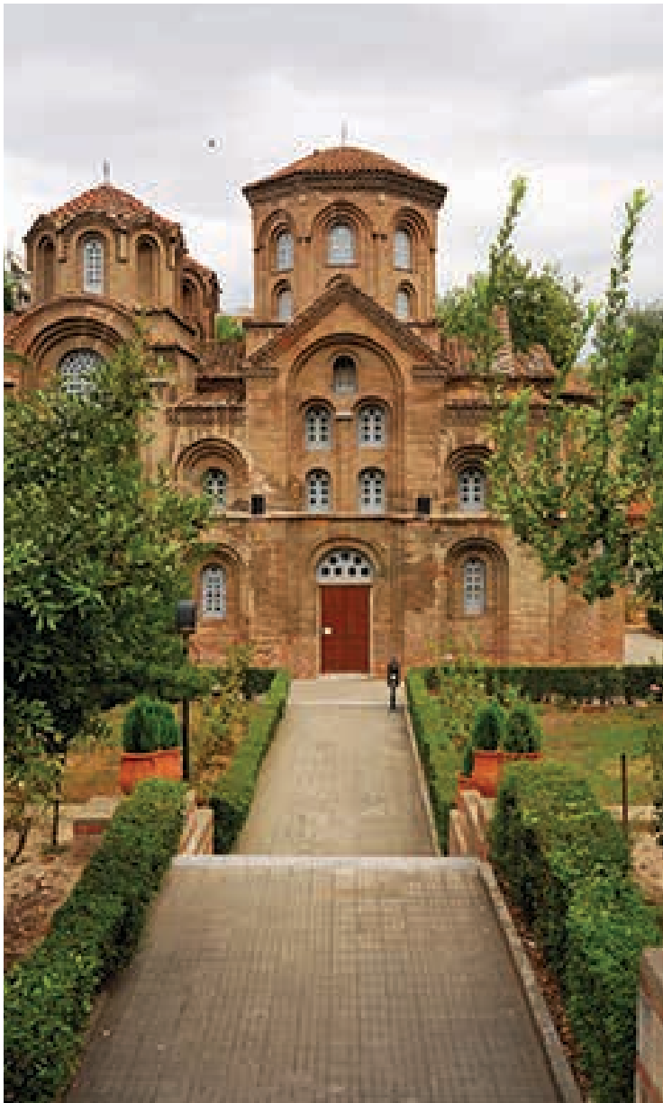
Panagia Chalkeon Church Thessaloniki.

a walking tour of Skopje's old market and the Holocaust Memorial Center for the Jews of Macedonia. The Memorial Center is located in the so-called Jewish Quarter of Skopje, which was the center of Jewish life in this city until the deportation of the Jews. The Holocaust Memorial Center for the Jews of Macedonia was officially opened in 2011, exactly 68 years after the German forces deported the Macedonian Jews to the Treblinka extermination camp.