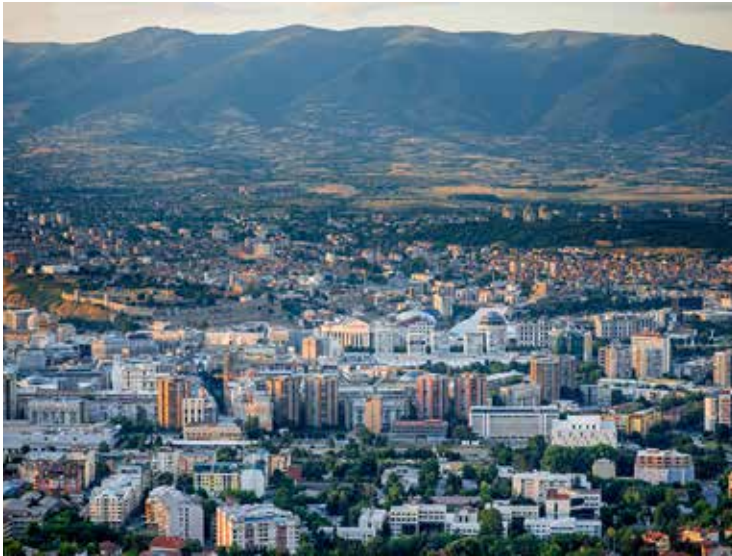
Panorama of Skopje, Macedonia

Return to Sofia in time for a festive Shabbat dinner (included), followed by a special performance of local music.