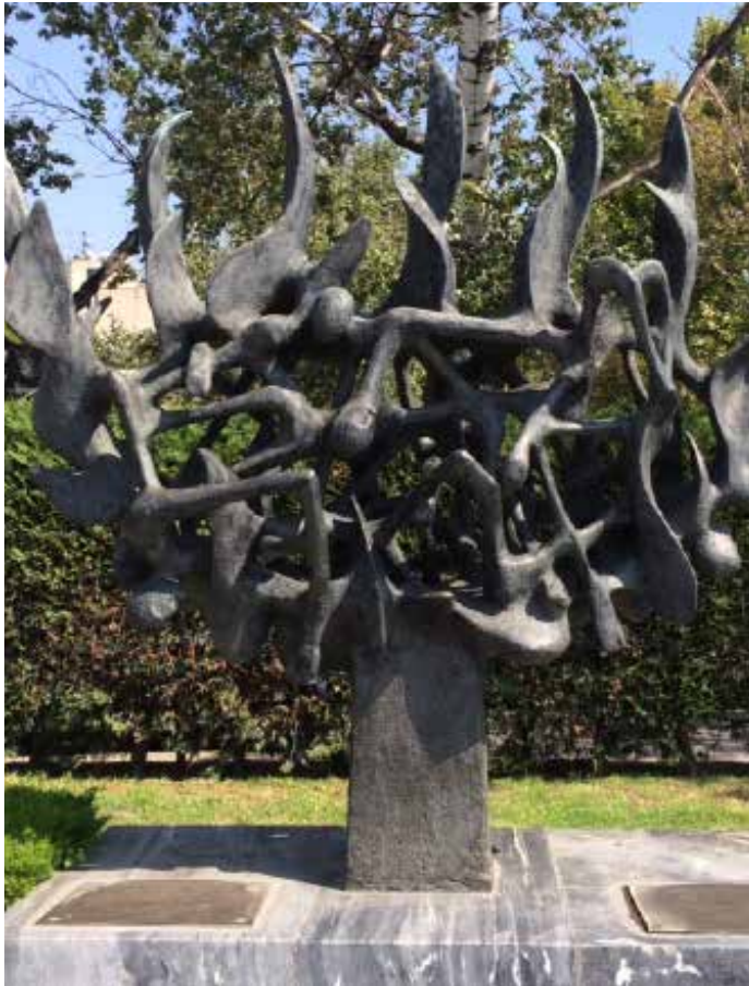
New Holocaust Memorial, Thessaloniki