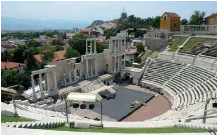
Roman Amphitheater, Plovdiv