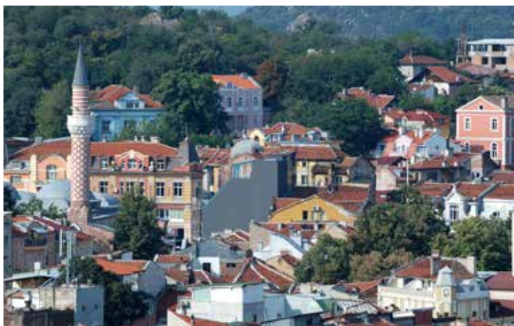
Old Plovdiv Cityscape