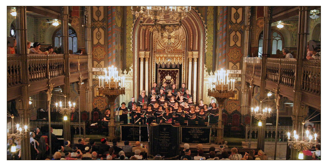
Choral Temple, Bucharest.