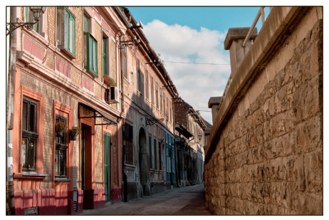
Old town Belgrade.

Afternoon: At leisure, or visit one of the nearby museums, including, among others, the Nikola Tesla Museum or Applied Arts Museum — all within a short walking distance from our hotel.