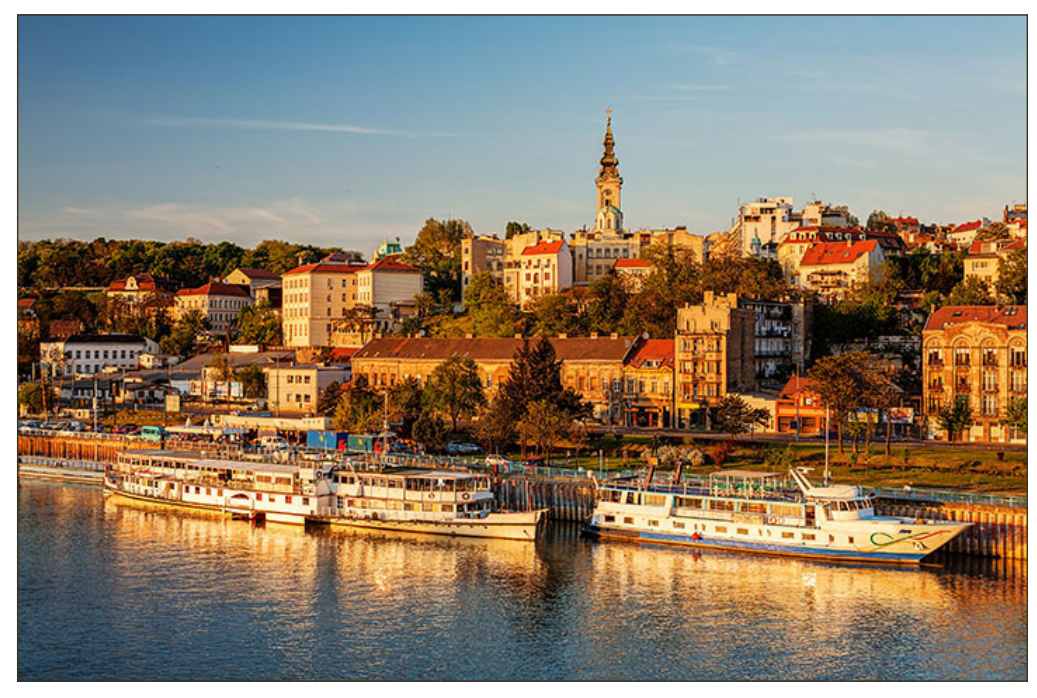
View of Belgrade from across the Danube.

A non-refundable deposit of $1000 per person will secure your place on the trip. A second non-refundable deposit of $1,000 per person due on March 1, 2016. The balance is due in full by April 30, 2016.